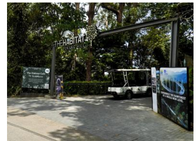
Photo: The Habitat Penang Hill

The park officially opened its doors to the public in 2016, evolving into a comprehensive conservation site.