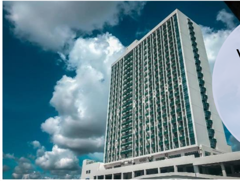
Vientiane Life Center