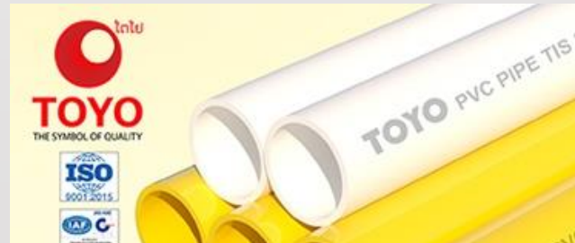
High quality pipe