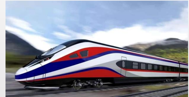
Lao-China Railway Thanaleng Dryport