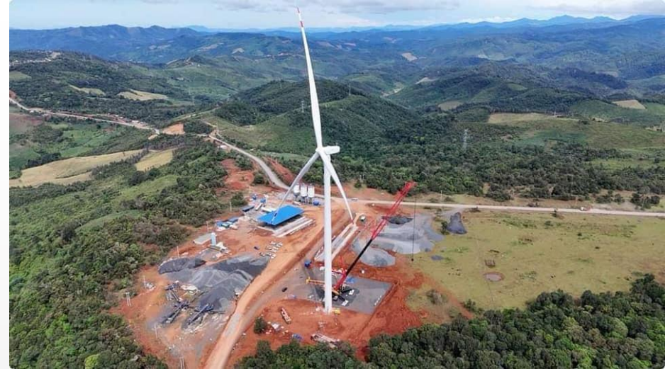
Monsoon Wind Farm, 600 MW, Sekong and Attapeu Province