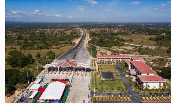
Vientiane-Vang Vieng highway