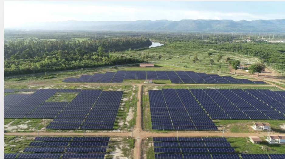
EDL Gen Solar Power Project, 15 MW, Vientiane Capital