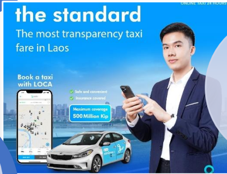
LOCA (On-line taxi service)