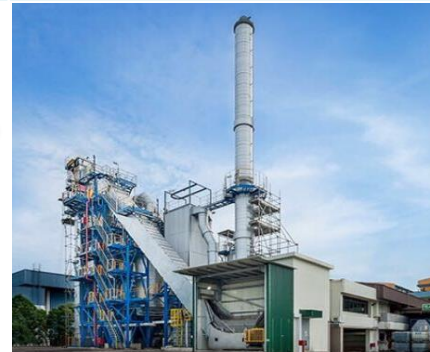
Vertical Waste Treatment System