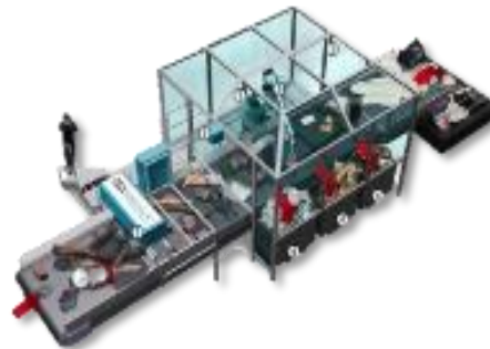
Robotic Waste Sorting