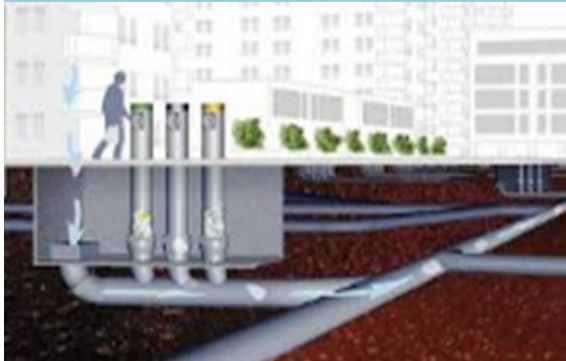
District-level Pneumatic Waste Conveyance System