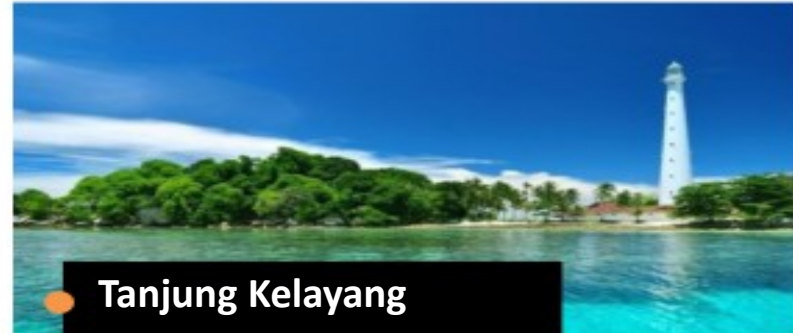
● Tanjung Kelayang