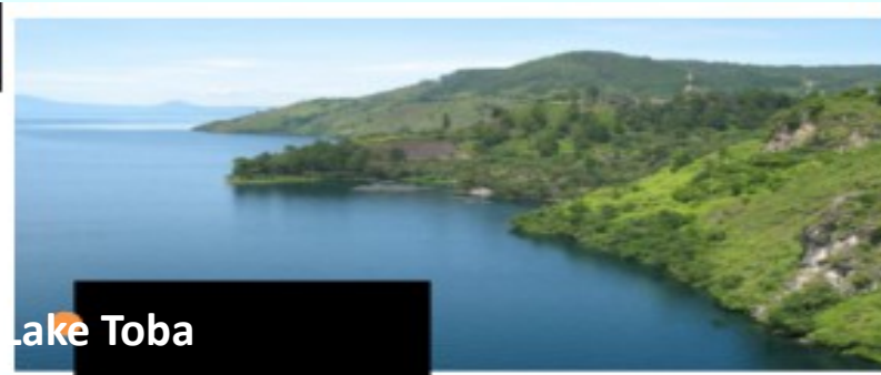
● Lake Toba