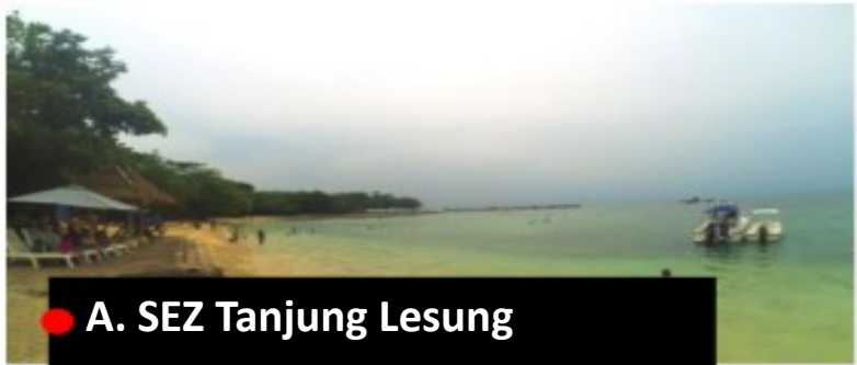
● A. SEZ Tanjung Lesung