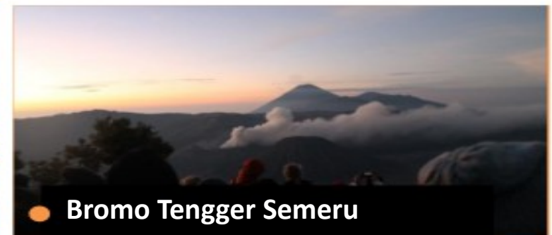
● Bromo Tengger Semeru