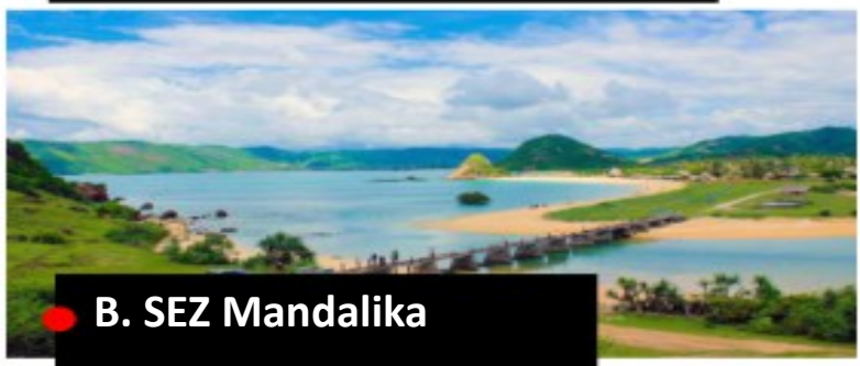
● B. SEZ Mandalika