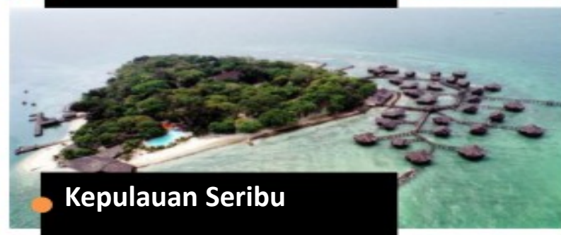
● Kepulauan Seribu